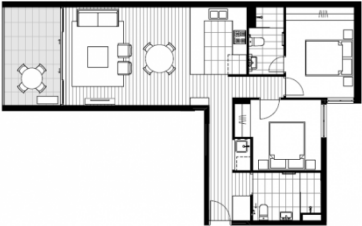
KEY PLAN - GROUND LEVEL